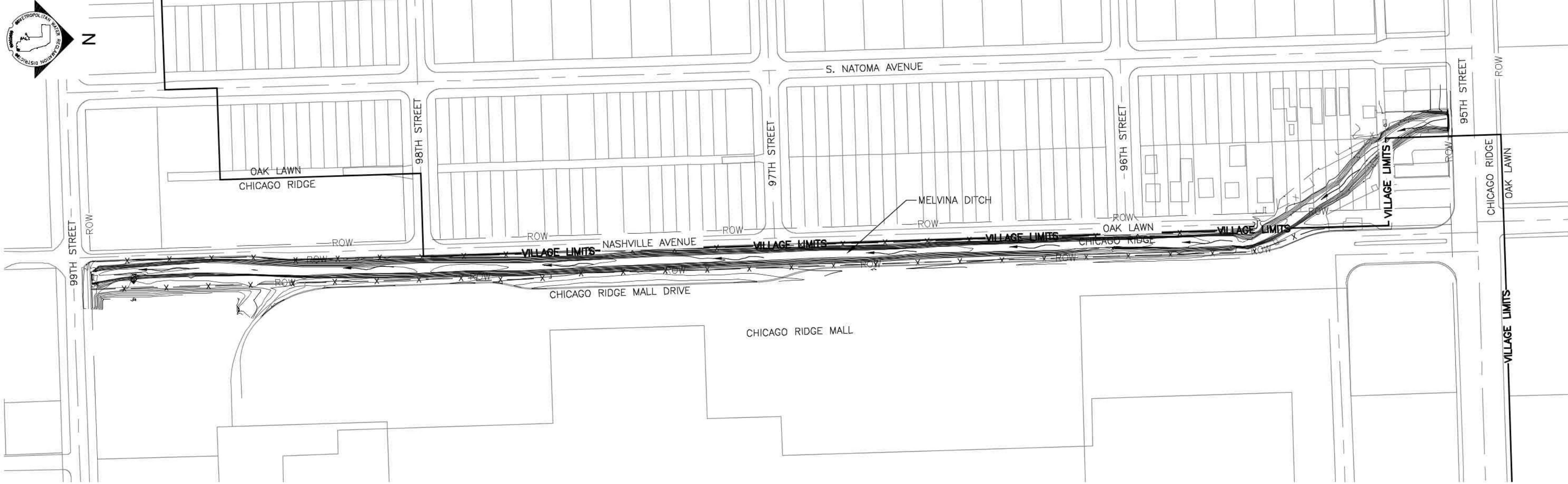
LOCATION MAP SCALE: 1" = 100'-0"